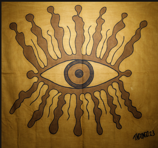
Nyêshi (Eyebrows), 2023 Clay and plant on cotton 120 x 130 cm