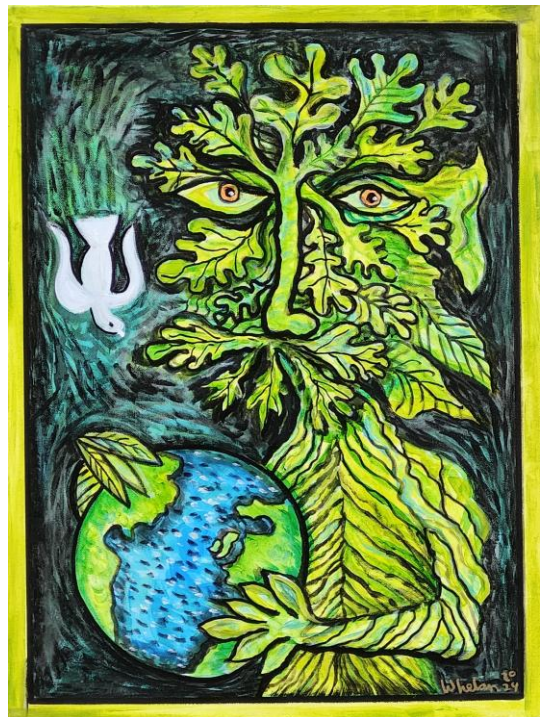
Two examples of Brian Whelan's work in NOAH: A Future Hope